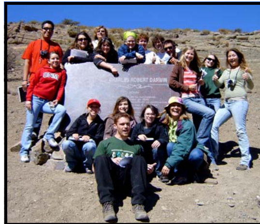
Students and faculty gather around the monument to Charles Darwin during their field study in Argentina.