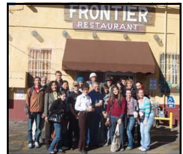
Gathering outside of the Frontier Restaurant, a favorite student hangout