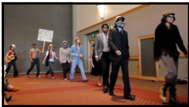
Pitching the class at the Spring 2008 Preview Night