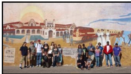
Class participants with Mark Rudd on a walking tour of Albuquerque