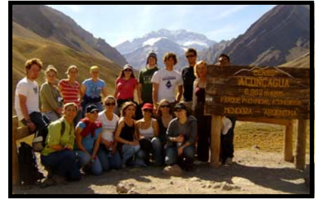
Students enjoy the view at Aconcagua National Park during their stay in Argentina.