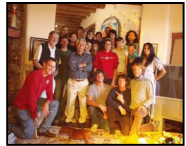
Visiting Rudolfo Anaya at his Albuquerque home